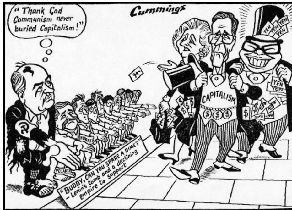
A cartoon published in Britain in August 1989. The figures on the right represent Britain, America and Japan.