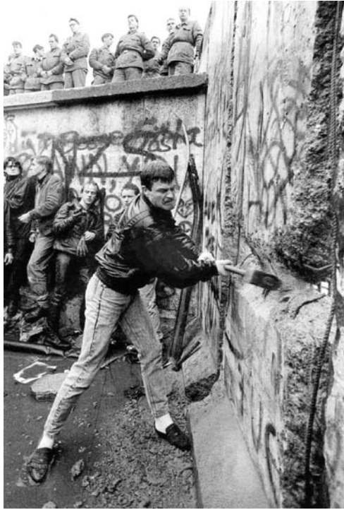
A photograph of events at the Berlin Wall in November 1989.

Although I was their superior the people I was working with that night were experiencing what I was. They kept demanding that I do something but I was not sure what to do. So I kept asking them, 'What shall I do? Order you to shoot?' The situation was now so serious that we'd reached a point where we could go no further. All I was thinking about now was to avoid bloodshed. There were so many people and they didn't have the space to move. If panic developed, people would have been crushed. I just did not want anybody to die. We had pistols, there were instructions not to use them but what if any of the men had lost his nerve? Even if he had shot into the air I cannot imagine what reaction that might have provoked. I called headquarters and said, 'We will have to let them all out.' The boss replied, 'You know your instructions and you must do only what they say.'